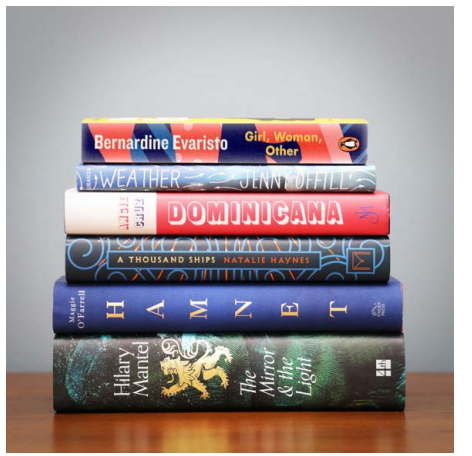
THE 2020 WOMEN'S PRIZE FOR FICTION SHORTLIST

is immensely knowledgeable about plants and their uses – and also 'knows' everything she needs to about someone by touching their hand. Later in the book we see Judith struggling to learn to read; Agnes says she has other skills. What value does education have in Hamnet?